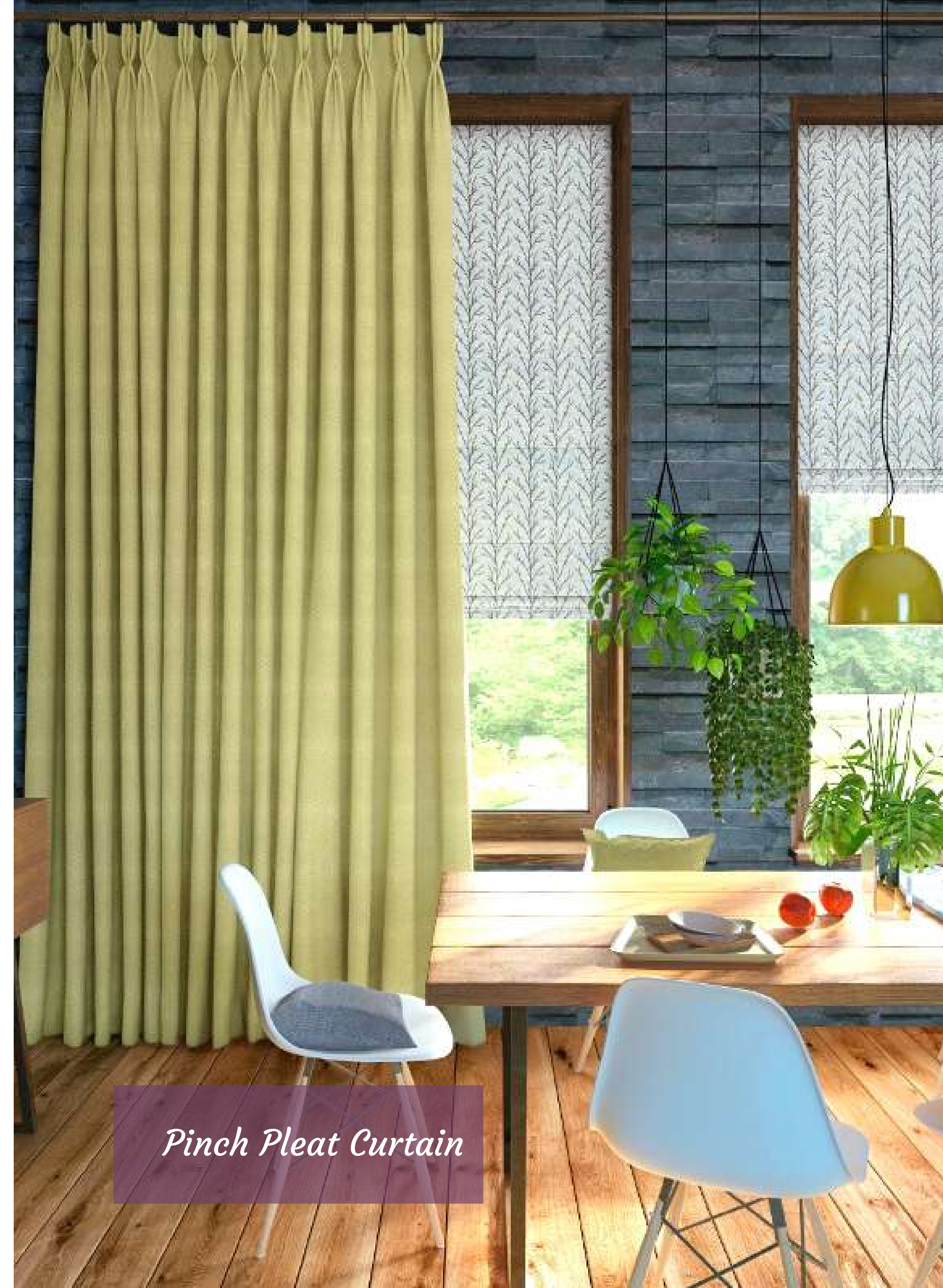
Pinch Pleat Curtain

If you desire any other headings our consultant will discuss your options, together with other aspects like curtains length. We recommend full length curtains (from pole/track to floor). Alternatively you can choose a "puddle" finish where the fabric gathers on the floor; ideal for curtains rarely opened or closed.