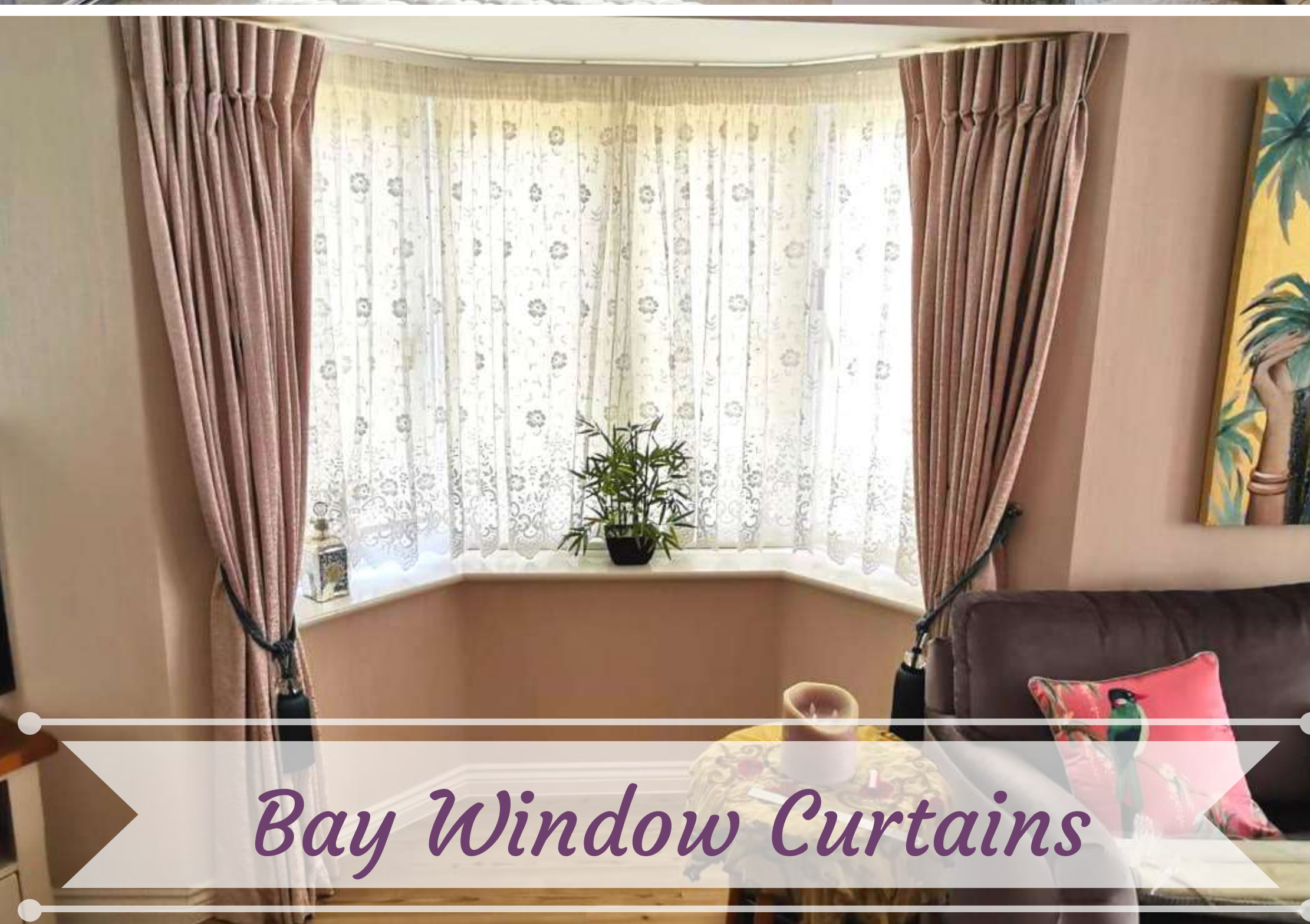
Bay Window Curtains