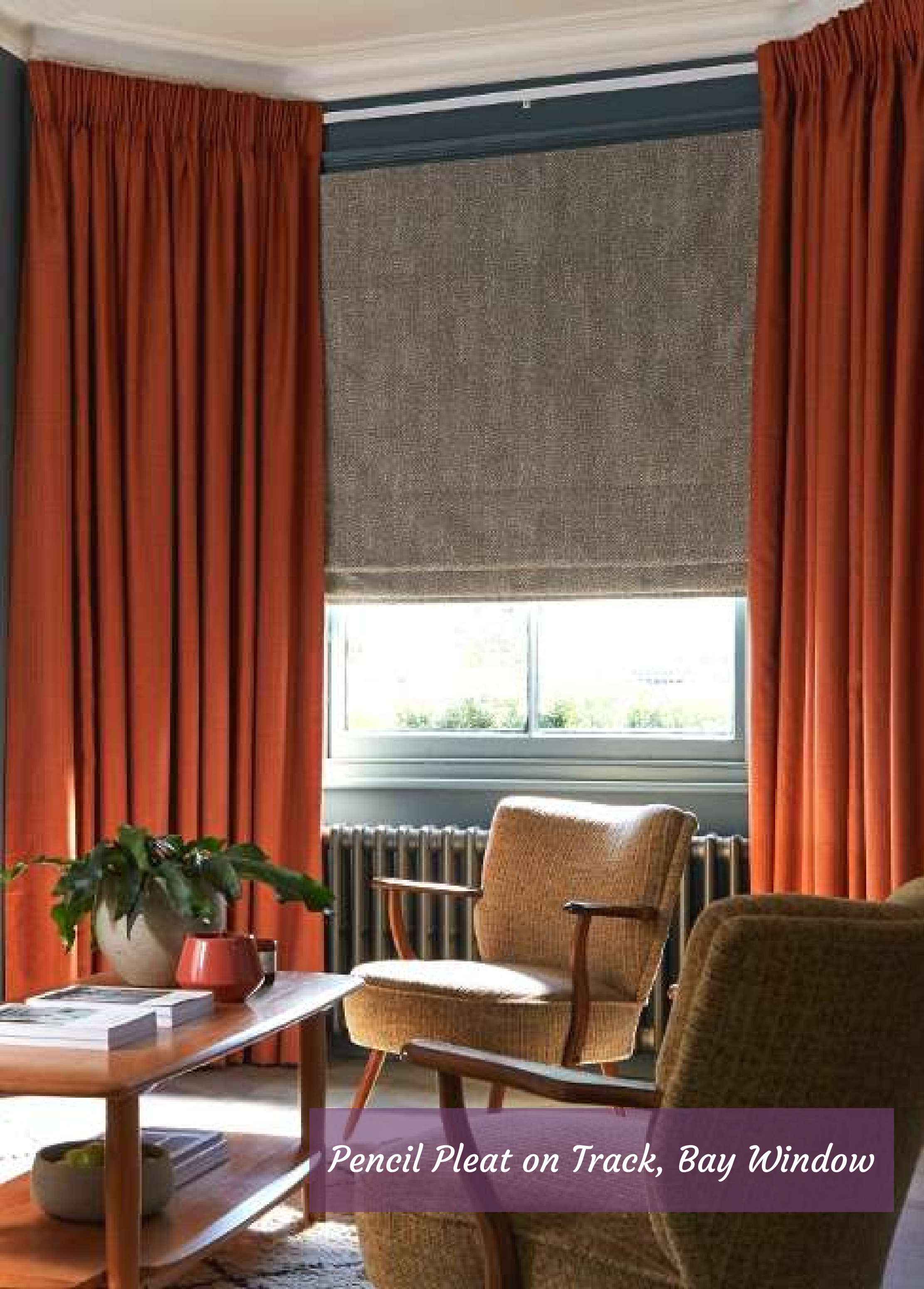
Pencil Pleat on Track, Bay Window