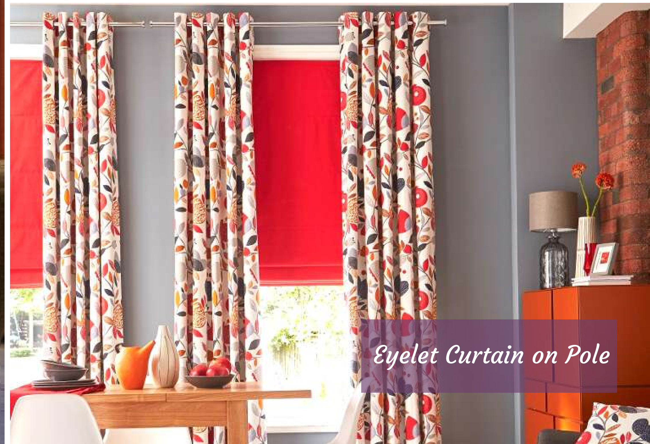
Eyelet Curtain on Pole

Operation available via a switch, remote control, app, home control hub. We cooperate with top suppliers like Silent Gliss or Somfy.